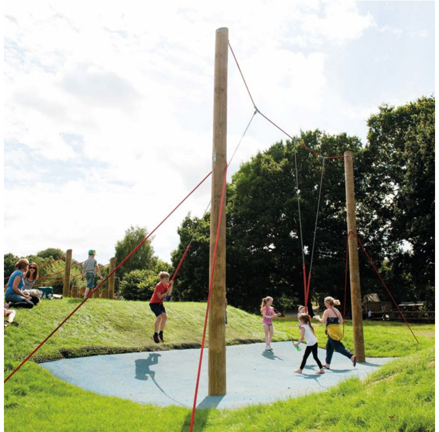
The photo shows different tensioning ropes, Photo © Paul Upward