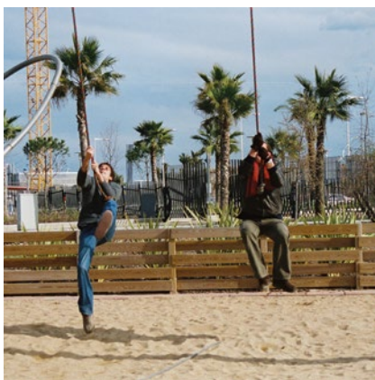
Order No. 7.65000 Swing Rope Equipment