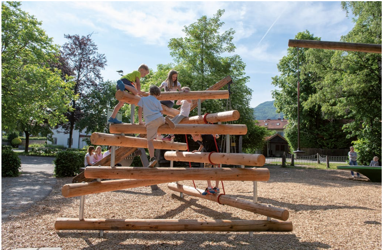
Climbing Stack 1