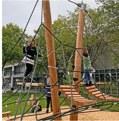
Order No. 13.01000 Small Net Pyramid.

„The best preparation for maths is not practising maths, but climbing trees,“ says renowned neurobiologist Gerald Hüther. Climbing connects both sides of the brain and promotes motor, cognitive and social skills. In addition, children learn to take responsibility in a playful way. With the Net Pyramid, we experience these phenomena. In addition, its interesting design attracts attention from afar. The three-dimensional net structure of the equipment provides children with a variety of challenges and stimulates their creativity. The Net Pyramid can be climbed, scaled, and explored.