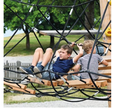
Order No. 13.01001 Optionally available element