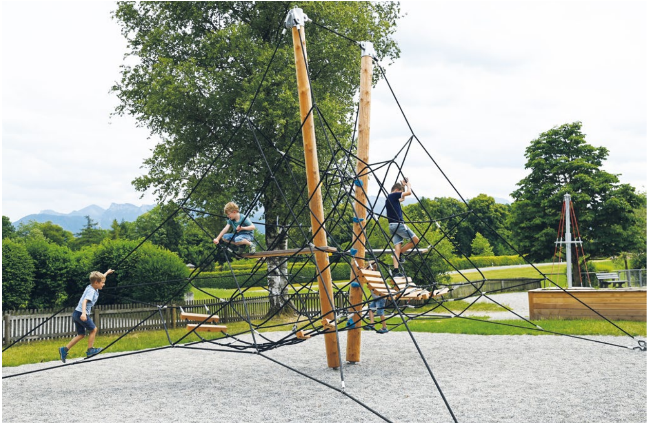
Order No. 13.02000 Middle Net Pyramid. The Photo shows the basic equipment incl. all optionally available installation elements.

It enables children to experience height and creates tactile sensations to their hands and feet. In addition, the equipment offers attractive seating for resting, observing, and talking, e.g., if supplemented by our optional hanging seats. Different levels and paths, which encourage a wide variety of movement and role-playing games, also promote concentration and dexterity.