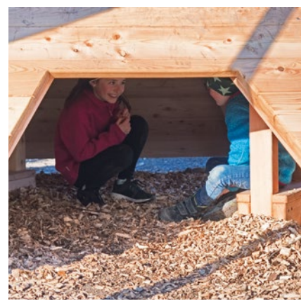
Order No. 4.06020 Little Mountain with Cave