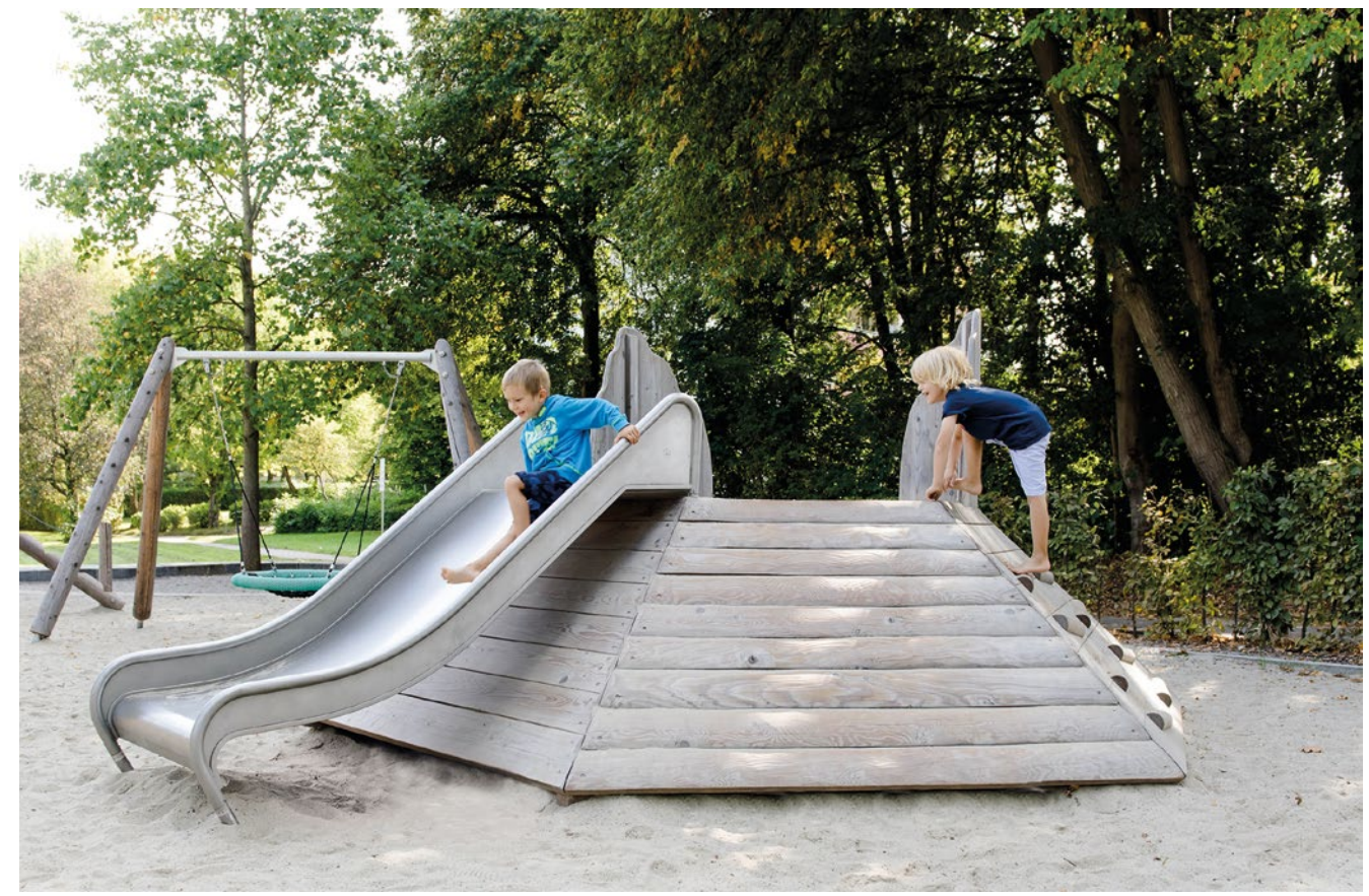
Order No. 4.06010 Little Mountain, old version without ventilation slits