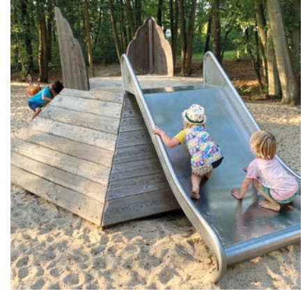
Order No. 4.06010 Little Mountain

Standing on top of the Little Mountain after climbing it in many different ways, gives rise to an unexpected feeling of freedom. The wooden slopes, each constructed in a different way, entice children to climb them. The slide ensures they get down quickly. The design of the Little Mountain lends a delightful character to any play area for the smallest child. The version of our "Little Mountain" with a cave also offers plenty of space under the play level for hiding and role-playing games.