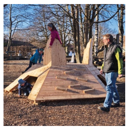
Order No. 4.06020 Little Mountain with Cave